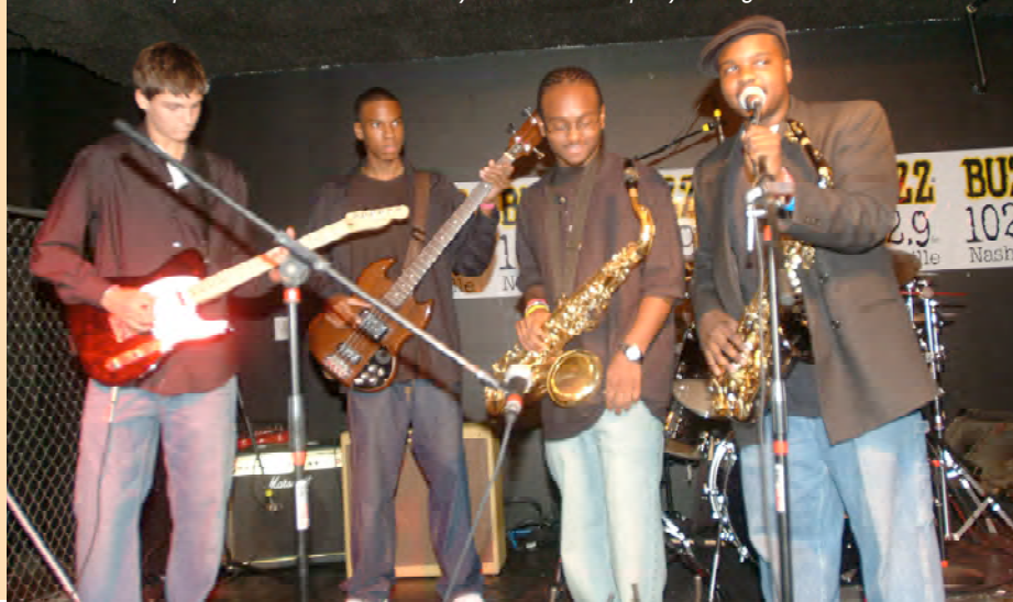
Teen musicians perform at the 2005 First Day back-to-school party for high school students