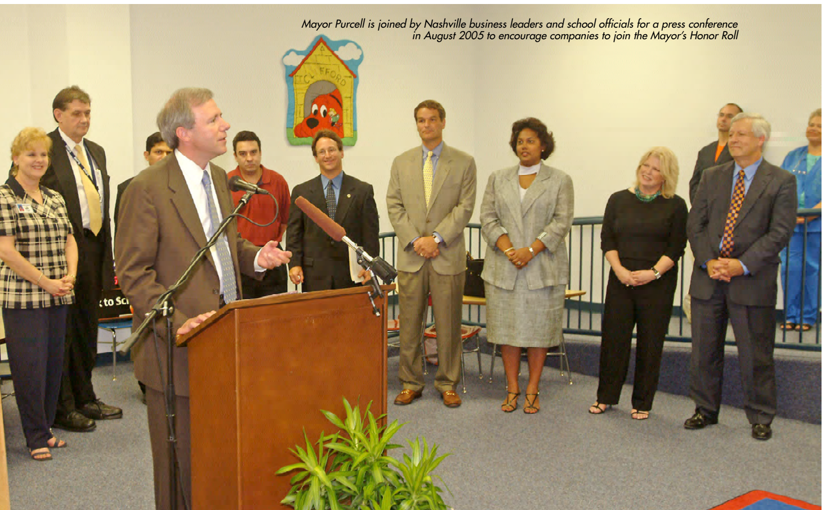
Mayor Purcell is joined by Nashville business leaders and school officials for a press conference in August 2005 to encourage companies to join the Mayor’s Honor Roll

Nashville educators attribute much of the steady increases in civic confidence and investment to the mayor. Garcia says that Mayor Purcell’s broad-based effort to heighten public confidence in the schools has paid off in increased public participation and investment. The effort involved many civic and educational leaders, but Garcia