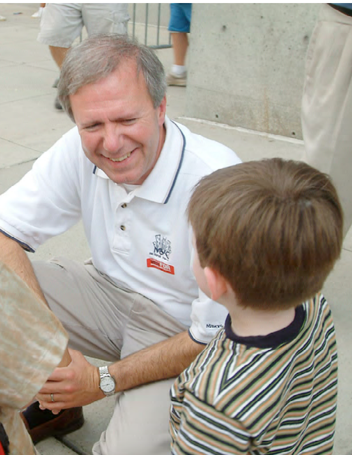
Nashville mayor Bill Purcell chats with students at the Mayor's First Day Festival on August 15, 2005

Nashville's Purcell, on the other hand, embraces education improvement as the