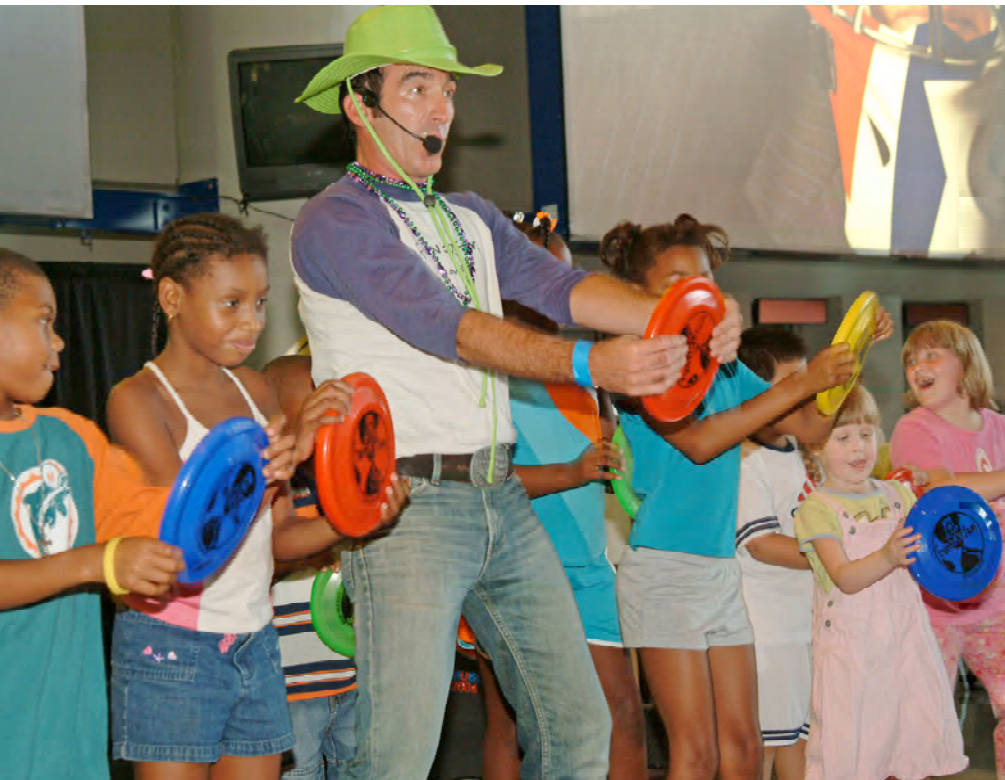
Students enjoy free entertainment in Nashville's downtown arena at the 2005 First Day Festival

Purcell recognized that pursuing a big budget increase for education at the outset of his term would be a difficult sell. The public's opinion of the schools was too low to support such a reward. Like many urban districts, the Metropolitan Nashville Public Schools were losing student population to private schools and to more affluent school districts in adjoining Davidson County. Moreover, new arrivals to greater Nashville were avoiding buying homes in Nashville, in large measure due to the poor reputation of the public schools. The schools were beleaguered by the symptoms familiar to urban systems in decline: physical facilities in disrepair, stagnant test scores, chaotic learning environments, and high teacher turnover.